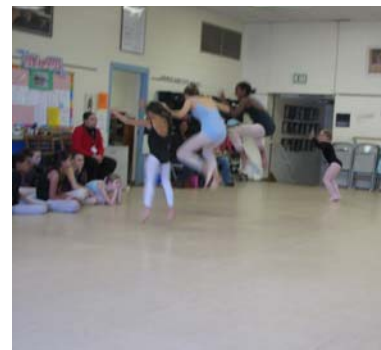
The solution - a series of wonderful jumps!! Hurrah!!!