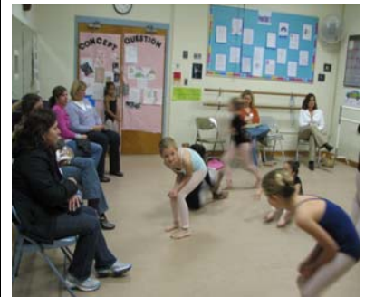
Tuesday dance parents watch students dancing in a Dance Perspectives class

We are thankful for our supportive parents!!!!