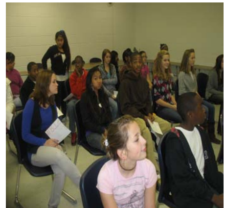
Thursday Students listen to an overview of the Academy programs