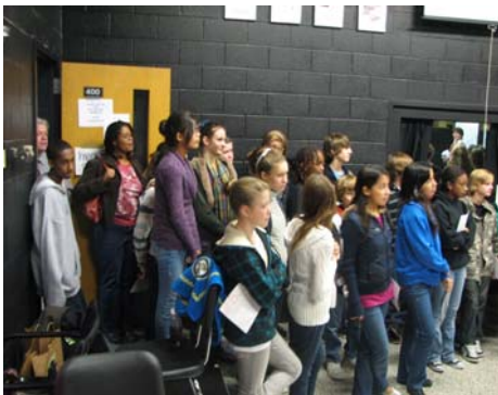
Wednesday Students tour the Black Box theater