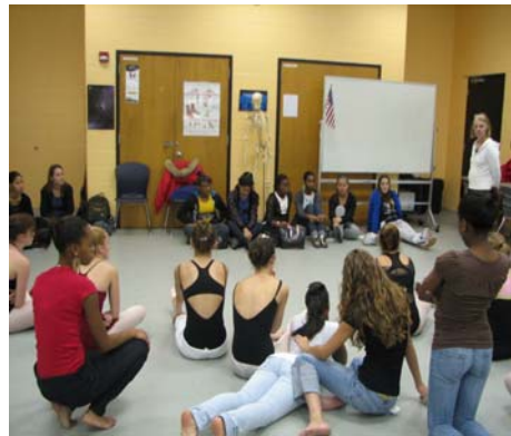
Friday Students , in one the dance studios, listen to current VPAA dancers describe dance program