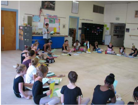
Monday Students in Dance Perspectives Class