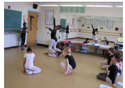
Members of the Friday Time team work on their dance about changing from kernels to popcorn.