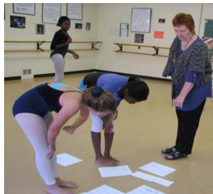
She is helping two Monday students use symbols from the Language of Dance™.